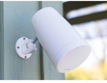
Wall Mount (WP40XT & WP65XT Only)

The Dayton Audio WPX line of Compact Pendant/Landscape Speakers are a versatile solution for high-quality indoor and outdoor audio. Their durable IP66-rated ABS enclosures ensure reliable performance in any environment, while their built-in passive radiators delivers exceptional bass response uncommon in pendant speakers. With flexible mounting options and 70V/100V or 8-ohm compatibility, these speakers adapt seamlessly to commercial or residential installations, offering outstanding sound clarity in a compact, stylish design.