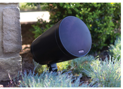
Landscape Mount (WP40XT & WP65XT Only)